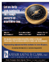
Kayser Layne & Clark, PLLC