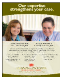
Clayman & Associates